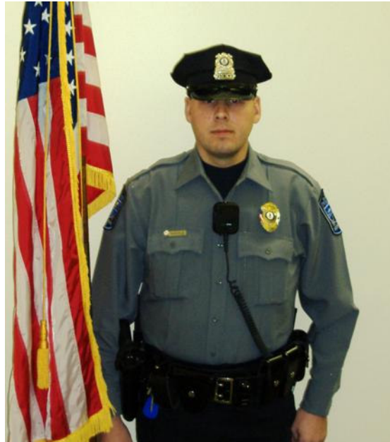
Employee of the Quarter